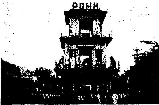
One of 800 Recital Minarets of the Hoa Hao Buddhist Church confiscated by the government after 1975. This place where religious leaders once preached, communist cadres now use to dry their laundry.