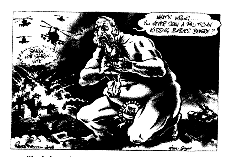
The Independent (United Kingdom), January 27, 2003

On the coffin: "Al-Hariri"; on the right, "The Beneficiaries", and on the left, "The Losers – France, Lebanon and Syria".