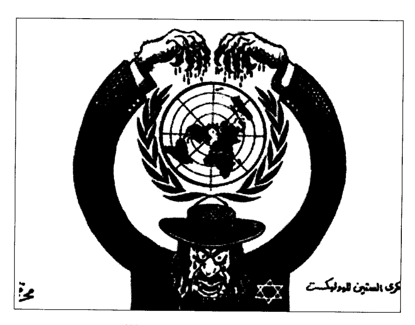
Akhbar al-Khalij (Bahrain), January 2005