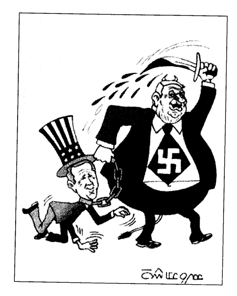
Al-Wafd (Egypt), March 27, 2004