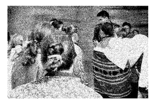
A police agent followed an AGA worker as he distributed aid to Baby Shower recipients, recording his every action. (Background deliberately blurred to obscure location.)

A field worker told me, "It's hopeless. If we continue the program, we might end up in prison. If the government wants to arrest someone, there's no shortage of made-up charges. In China, it's not easy to do good even if you want to. The government wants to watch everything. They don't want to overlook any detail, even your thoughts. They have all the money and all the manpower. That's what it means to have a strong and glorious country."