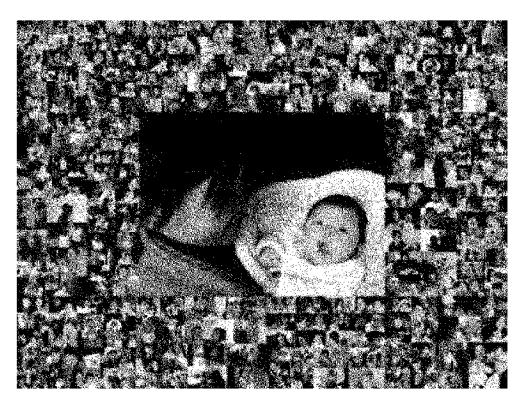
A sampling of the baby girls and families who have received aid through All Girls Allowed's Baby Shower program.

agents to record the aid distribution by video. (In order to protect the personal safety of our workers, we will not identify the specific location.) These agents followed the AGA workers on their visits to families in remote villages, recording the conversations between our workers and the beneficiary families. While AGA workers and local families were talking at the doorstep, they stood nearby. When our workers entered local houses, the police would enter and sit down as well. One may well imagine the anxiety and oppression felt by the AGA workers and rural families. Some families requested to stop receiving aid in order to escape police attention, fearing that the attention would have long-lasting ill effects on the entire family. Many volunteers also decided to stop contributing their time to this charitable program. They had volunteered with AGA to serve the local community, but found themselves treated as suspected felons under open police surveillance. Neighbors of AGA workers also became suspicious and began opposing their work.