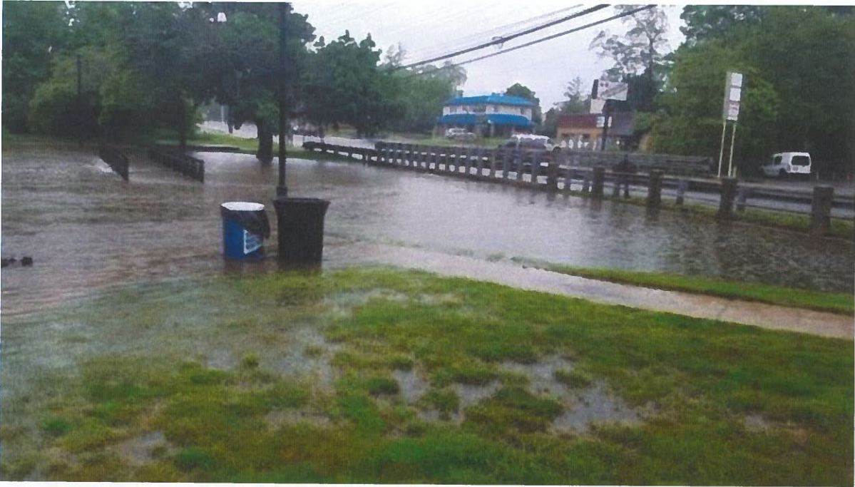
Flooding near Etoncrest Apartments, Eatontown.