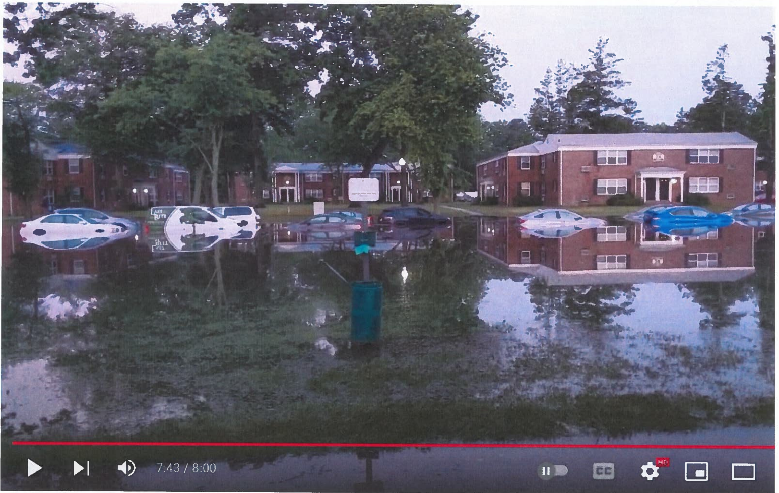
Flash Flooding at Eatoncrest Apartments - Eatontown, NJ - July 2021