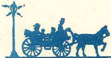
Raymond Coles Mayor, Township of Lakewood

Thank you for your continued leadership in the U.S. House of Representatives!